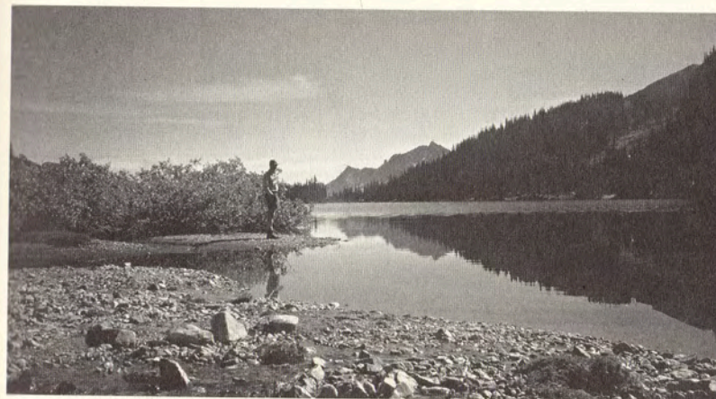
Sun God Mountain and its reflection in the western end of the lake.

Zero your odometer at the Pemberton PetroCanada junction, 90 km (60 mi) north of Squamish. Turn left into Pemberton. At 1 km (0.6 mi) go right at the T-junction. At 3 km (1.9 mi) turn left for Pemberton Meadows. At 25 km (15 mi) turn right onto Lillooet River Forest Service